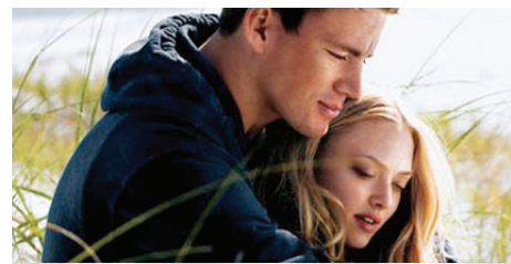
Showing on Encore Love – June 19. Rated PG13.

It was two weeks that would change their lives forever. Soon after John (Channing Tatum) and Savannah (Amanda Seyfried) fall madly in love, their relationship is put on hold. With one leaving to complete his service, and the other to complete her college education, they pass the time by exchanging a continuous stream of love letters, until they can be reunited permanently a year later. But when war breaks out, their separation is extended indefinitely. Will their